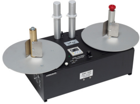
RRC-250 with 3" Unwind & Rewind Shafts. HWD: 13" x 25" x 10" (330-mm x 635-mm x 254-mm)